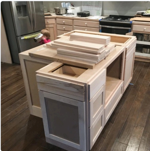
Added Jan 8, 2026 at 11:20 PM Unfinished kitchen island and perimeter cabinets, with stacked components.