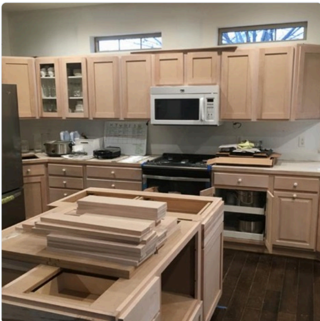
Added Jan 8, 2026 at 11:24 PM Kitchen cabinets installed, awaiting finish, with appliances and island materials present.