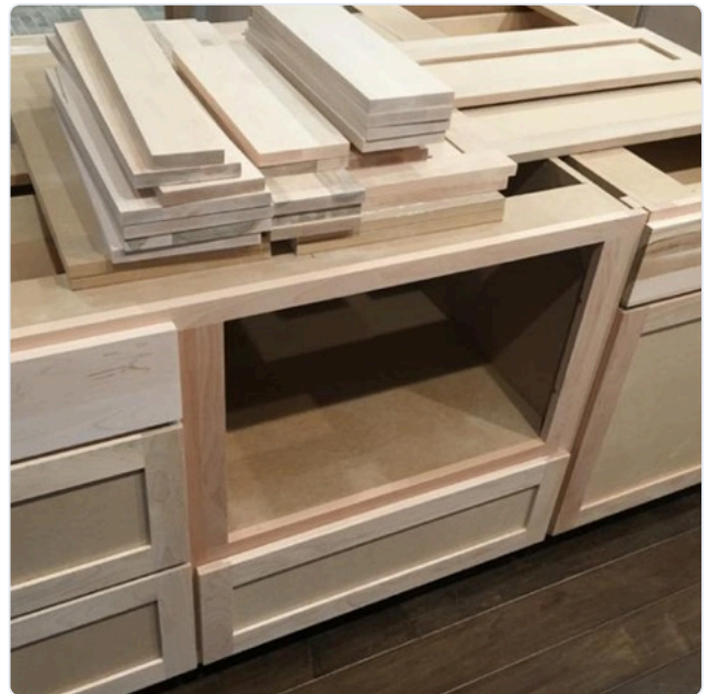
Added Jan 8, 2026 at 11:21 PM Unfinished wood base cabinets with stacked drawer fronts and doors visible.